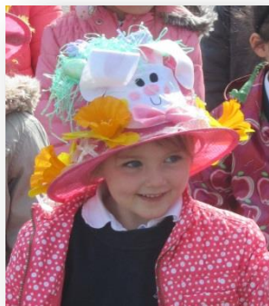
Well done to all of our pupils who dressed up in their Easter Bonnets on the day of the holidays.